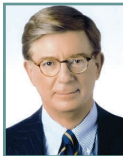
George F. Will Pulitzer Prize Winning Columnist for The Washington Post and Newsweek Essayist