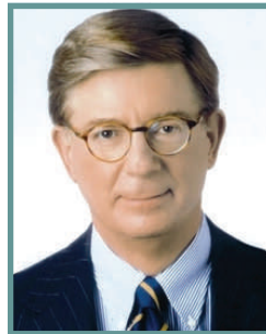
George F. Will

Pulitzer Prize Winning Columnist for The Washington Post and Newsweek Essayist